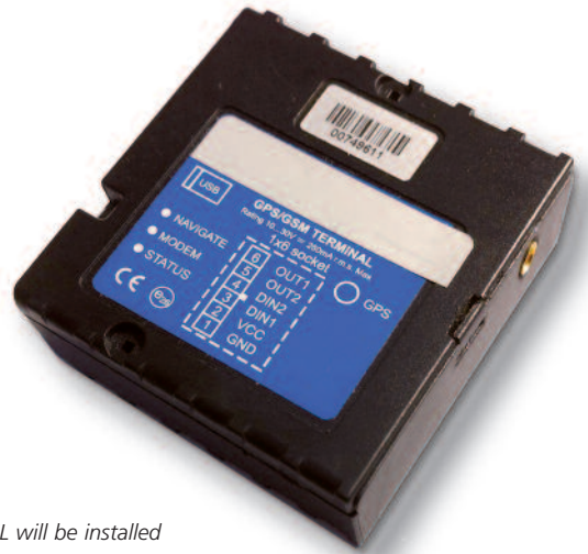
Fleet View XSL will be installed at a hidden place in the vehicle